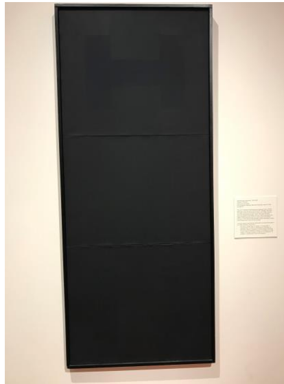
Figure 1. Ad Reinhardt, Triptych , 1954-55

abstract art. The first work of art is entitled Triptych (1954-55, Figure 1) and was painted by American artist Ad Reinhardt. Triptych looks to be the definition of “abstract,” as it is simply composed of three canvasses that appear to be completely black. Upon close examination, however, one sees that there is a subtle spectrum of different shades of black. One could argue that this painting alienates those who do not understand Reinhardt’s intention to create a piece that contains “no things, no ideas, no relations, no attributes, no qualities—nothing that is not of the essence” (Reinhardt, 1955). When presented with something so abstract, however, the viewer has more of an opportunity to be provoked by the artist’s avant-garde choices and feel the “aesthetic emotion” that formalists and expressionists believe to be an essential part of the artistic experience.