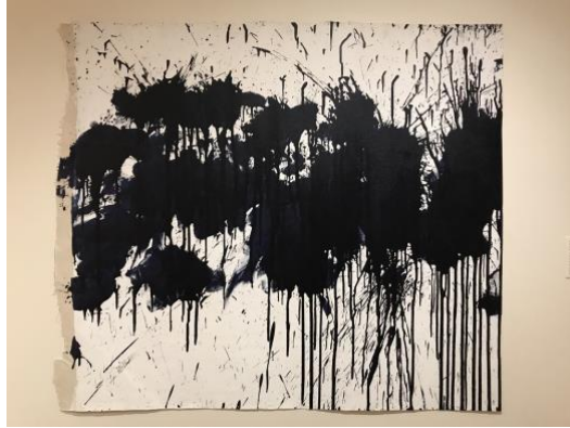
Figure 2. Ushio Shinohara, Boxing Painting, 2009

My final example – Laszlo Moholy-Nagy’s K I (1922, Figure 3) – is not quite as abstract as are Triptych and Boxing Painting , but nevertheless seems to ask for a cognitivist explanation. The piece is composed of a combination of shapes (primarily rectangles and squares) and utilizes little color. Moholy-Nagy was part of the Constructivism movement, in which artists sought to “construct” art from basic shapes in order to make their work accessible to a universal audience. Although a cognitivist theorist would argue that when one enjoys K I , he or she enjoys perceiving the arrangement of shapes and colors, the stimulus theory would counter that one need not cognitively perceive and, by extension, understand the shapes and colors of a painting in order to enjoy looking at it. We (i.e. the audience) regain our autonomy when art lacks an explanation. This is to say that we become free to feel emotions that may not be the emotions that the artist attempted to convey but are nonetheless worthwhile because some quality of the artwork speaks to our non-artistic emotional experiences, in turn “[producing] bodily reactions that are experienced as personal emotions” (Mosley, 2017, pp. 3-4).