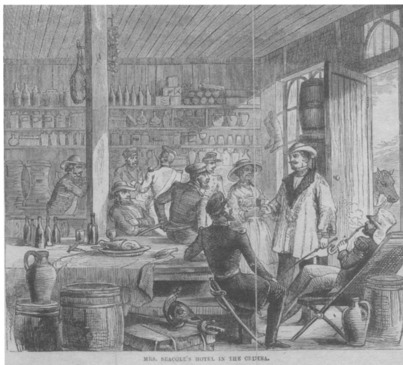
Mrs. Seacole's Hotel in the Crimea.