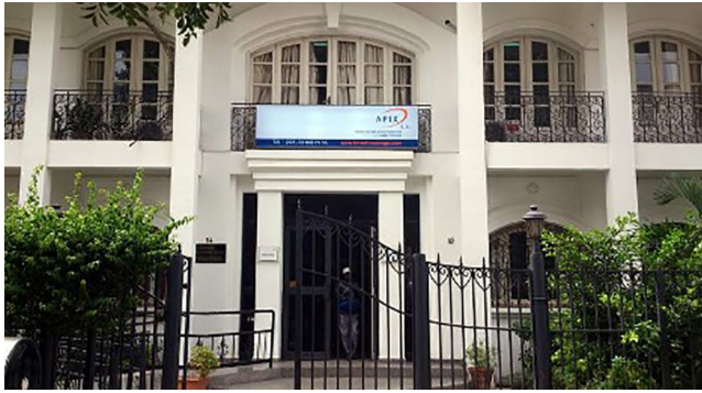
Figure 2. Entrance to the Agence pour la promotion des investissements et des grands travaux (Agency for the Promotion of Investments and Major Works, or APIX) headquarters.

These open layouts are intended to appeal to an international clientele, promote teamwork among senior staff members, and enable collaboration with representatives from other public and private-sector offices throughout the city. “Team members” are expected to work together on projects, to troubleshoot when problems arise, and to “do a little bit of everything,” in the words of one staff member, rather than focus solely on their own workload and duties. In our conversations, APIX staff took pride in the fact that meetings at the agency began on time, deadlines were firm, and standards of performance were exacting, “just like in American corporations.” One employee described to me the great satisfaction he gained from working for an organization where results were “immediate and visible” in ways they would not be within a ministry office.