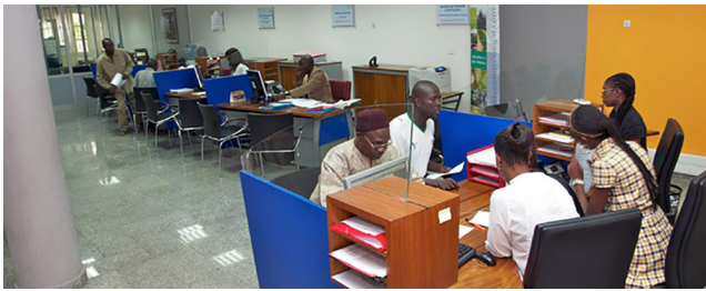
Figure 3. Le Guichet Unique [The "One Stop Shop"]. Promotional photo of Le Bureau d'Appui à la création d'entreprise (the Business Creation Support Bureau, or BCE). Note the relatively contained presence of paper.

Similarly, when I would return from meetings or interviews at other government offices in the city, my colleagues would sometimes jokingly inquire about how much paper I encountered while there or how long I'd spent just waiting around. Staff members imagined their work as an antidote to the kind of bureaucratic "red tape" that Gupta (2012) describes. For Gupta, the work of bureaucratic writing—and the unevenness and arbitrariness of inclusion, redistribution, and care that writing processes necessarily entail—inflicts a kind of structural violence on the lives of the poor. My APIX colleagues, by contrast, worried more about the materiality of paper—its physical and visual weight, its uneven and strained movements—and its impacts on investors and state workers themselves.