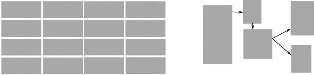
Figure 3 Comparison of structure of the Drupal Information Architecture (left) vs. the Plone Information Architecture (right).

Meanwhile, the Drupal Framework is much less object-oriented than Plone. Around 2000, Dries Buytaert decided to write Drupal in the scripting language PHP because of its simplicity; he wanted to develop a system that amateur Web developers could leverage. 36 At the time of Drupal's development, PHP did not support many object-oriented constructs; instead, it enabled users to script code that referenced and manipulated data stored elsewhere—in relational databases. Accordingly, Drupal still does not make much use of “classes”—structures for defining object types, properties, and actions in object-oriented systems. 37