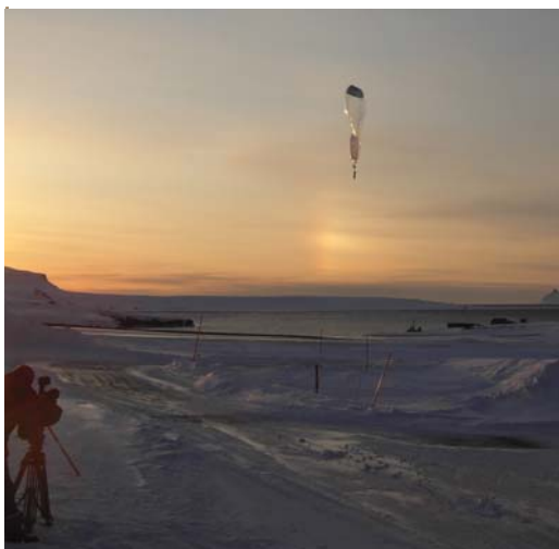
Figure 2. CMET balloon launched from Ny-Ålesund Svalbard, Norway. The balloon was shipped in a small package and operated from the United States.