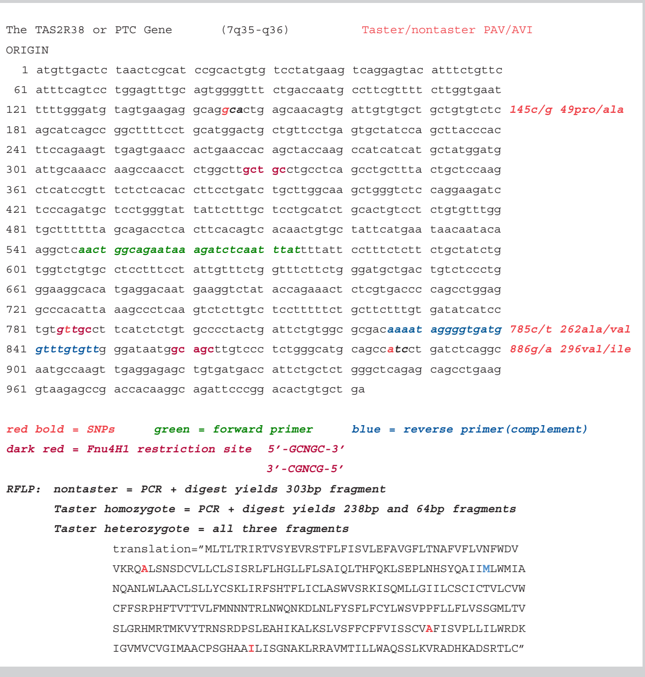
Figure 1. The Human PTC Gene. The gene that is primarily responsible for human PTC taste sensitivity is located on the long arm of chromosome 7. The sequence of the nontaster allele is shown below with attention drawn to common single nucleotide polymorphism sites (SNPs), Fnu4H1 restriction endonuclease sites, primer sites for gene amplification by PCR. The Figure also indicates the amino acid substitutions corresponding to the SNPs, the restriction digest fragment lengths obtained in RFLP analysis, and the amino acid sequence for the nontaster gene product. The amino acid sequence also indicates the initiation site for translation of the chimpanzee nontaster allele (light blue M). Note that the amino acid sequence given is still for the human nontaster allele, not the chimpanzee allele.

chimpanzee lineages and has been maintained in both species by balancing selection. However, while Wooding et al. (2006) demonstrated that indeed the same gene is primarily responsible for variation in PTC taste sensitivity in both species, the chimpanzee nontaster allele results from a mutation in the start codon (ATG to AGG) so that translation is initiated with the methionine at what is the 97th amino acid (see light blue M in translation