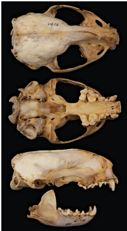
Fig. 2. —Dorsal, ventral, and lateral views of skull and lateral view of mandible of an adult male specimen AMNH (American Museum of Natural History) 71858. Greatest length of skull is 147.25 mm.

Skull (Fig. 2) measurements (mm) for 1 female and 4 males, respectively, from Suriname were: condylobasal length: 153.6, 143.1, 145.8, 155.8, 154.9; palatal length: 76.3, 71.5, 75.0, 77.8, 76.0; zygomatic breadth: 92.0, 85.0, 94.3, 94.9, 97.2; interorbital constriction: 17.1, 17.5, 15.8, 16.7, 17.4; postorbital constriction: 17.6, 18.1, 16.1, 16.7, 17.3; length of postorbital constriction: