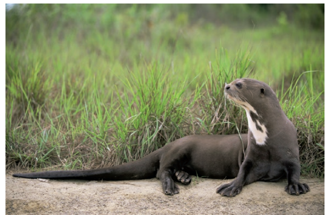
Fig. 1. —Adult Pteronura brasiliensis from Karanambu-Rupununi, Guyana.

Lutra brasiliensis Ray, 1693:189. No type locality given; stated as “in fluviis americae meridionalis” by Gmelin (1788:93); and subsequently restricted to “río São Francisco, en la orilla