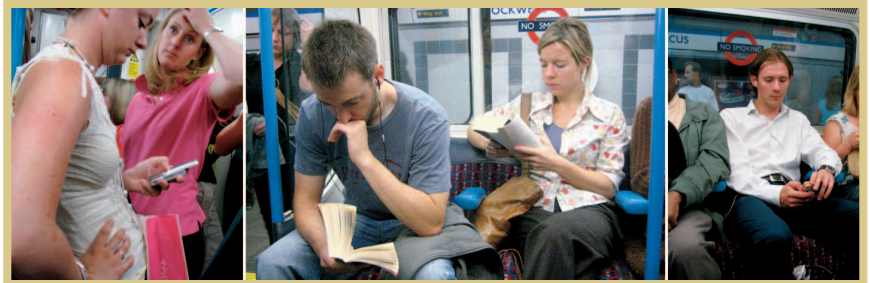
Figure 1. In the Tube's tight quarters at rush hour, passengers occupy themselves with many media forms: mobile phone games, books, and music players.

[Without a book, it's] a bit more boring. I just end up reading the ads or looking around. You are trying not to stare at someone and you are looking like a psycho.